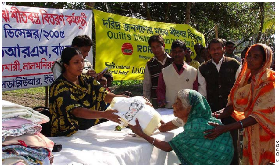
Distributing warm clothings

Selection of recipients and distribution was done by RDRS through Deputy Commissioners