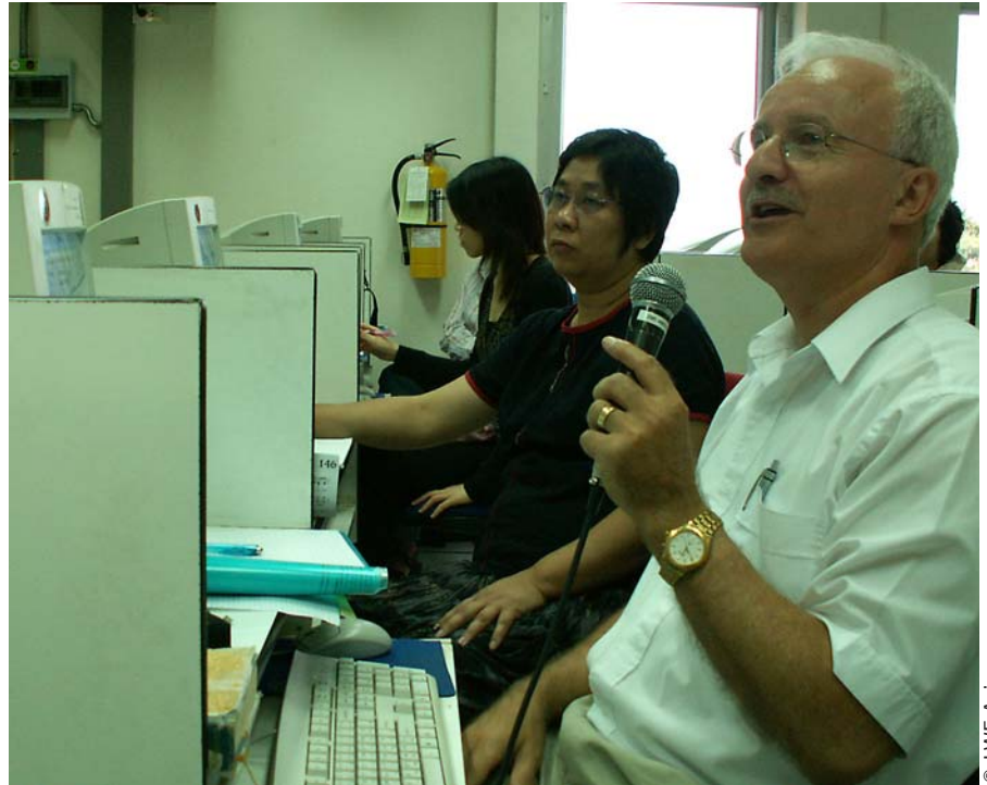
Keeping up-to-date with the latest information technologies (IT)