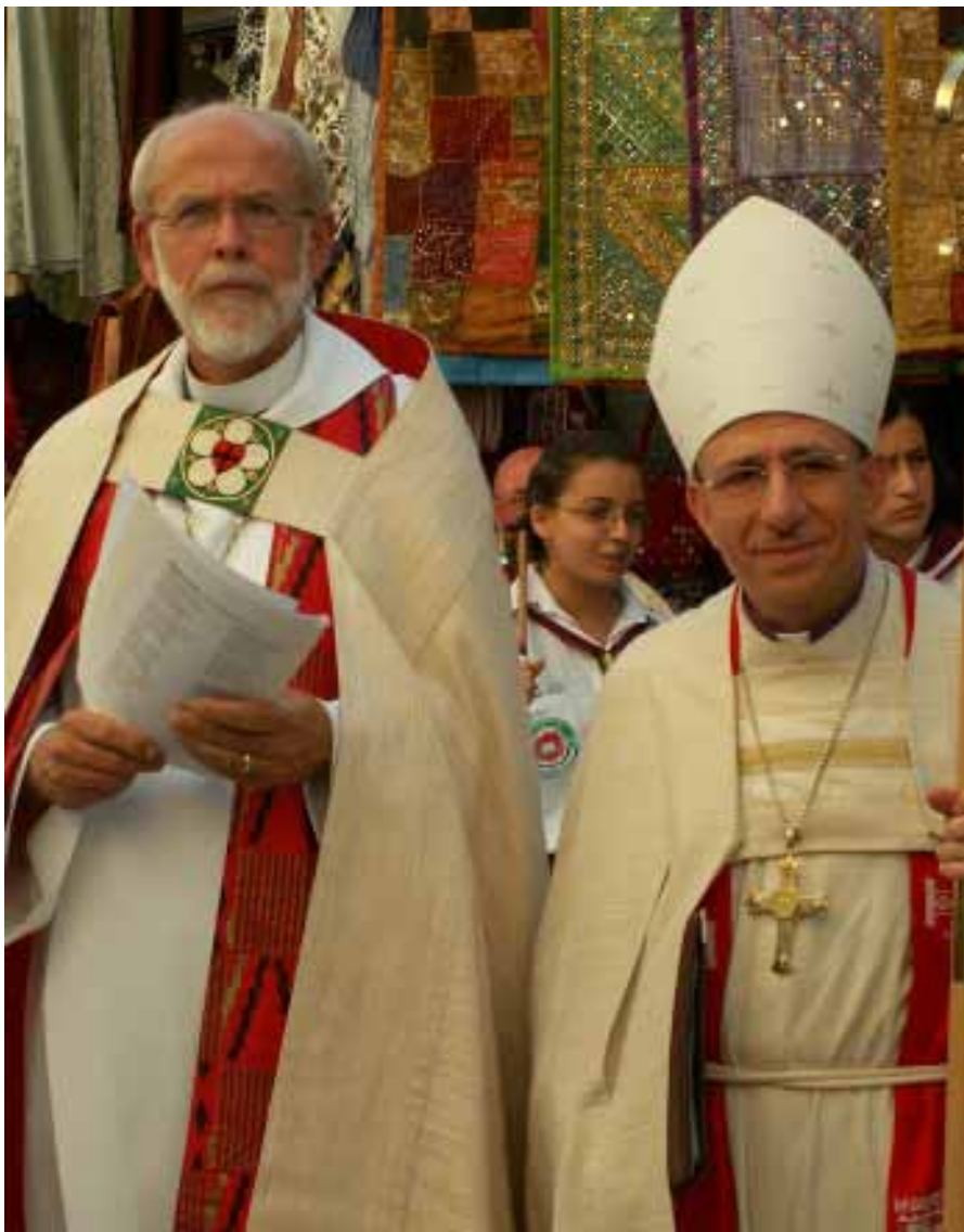
Waiting for the procession march into The Lutheran Church of the Redeemer