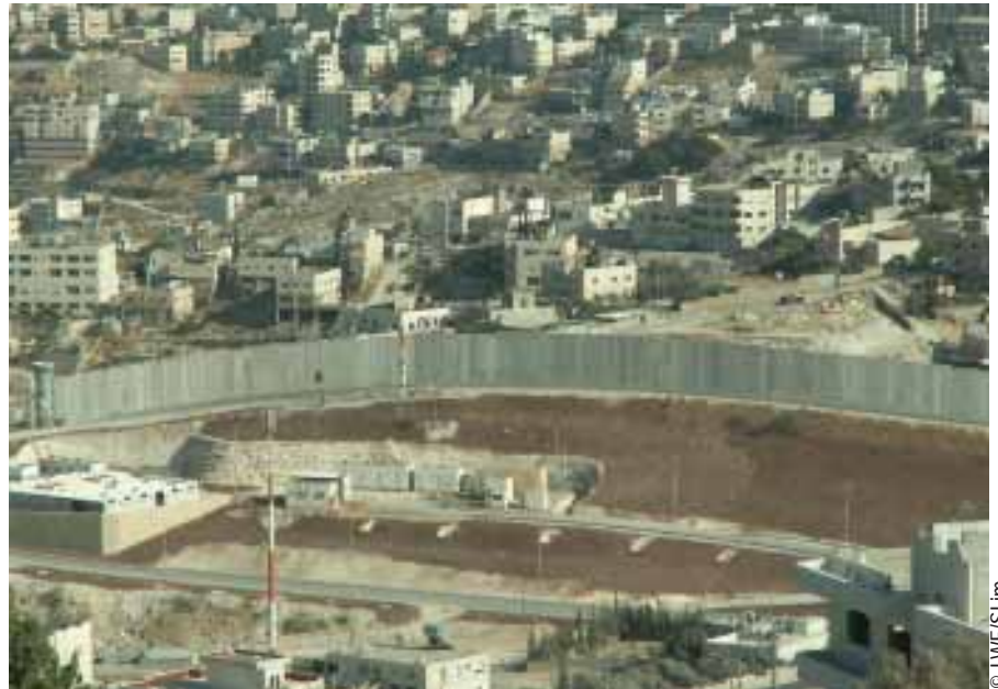
Dividing walls seen around the city