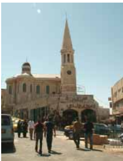
Christmas Lutheran Church that's next to Int'l Center of Bethlehem, venue of the LWF Council Meeting