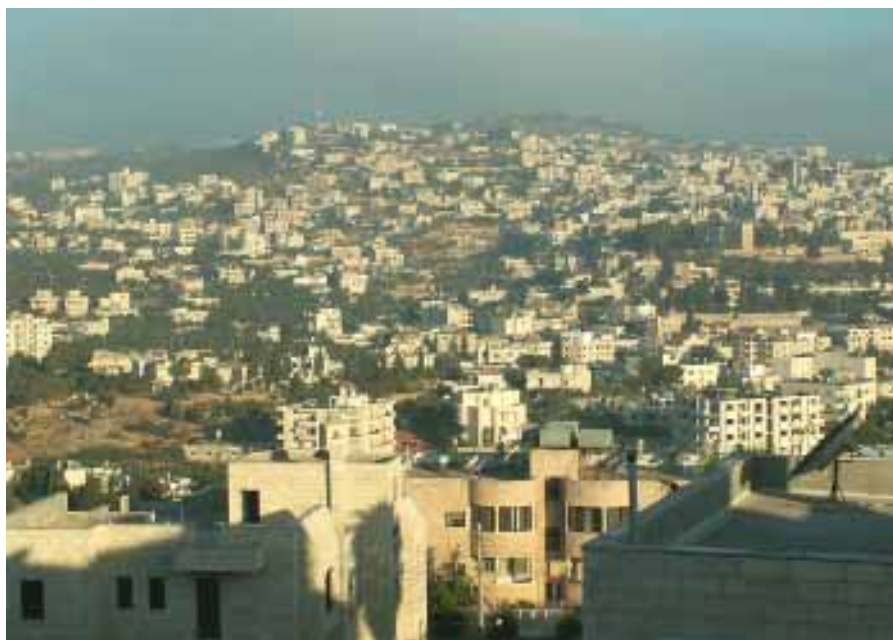
A scene of Bethlehem