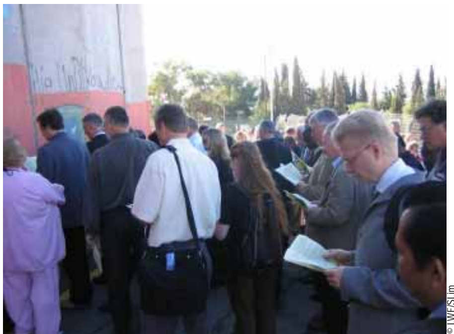
Special prayers at separation wall