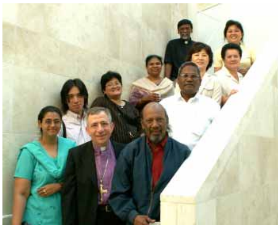
Council members & advisors from Asia