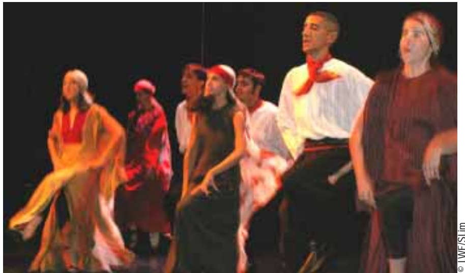
Cultural dance by students

The host church, ELCJHL treated all the delegates and participants of the LWF Council Meeting with a very special and exciting cultural evening that is filled with music and dancing. The presentations by its schools and congregations were impressive and well received with thunderous applause.