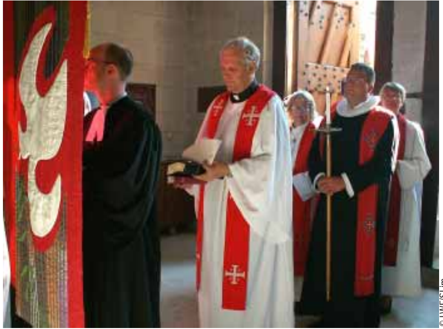
Processing into the chapel of the Lutheran Church of the Redeemer during the opening worship